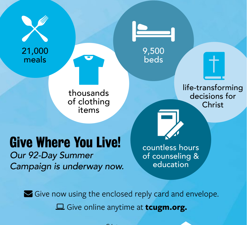
Through the 3 MONTHS of Summer your gift today helps provide...

This time of year, gifts typically drop off, so we need your help now more than ever.